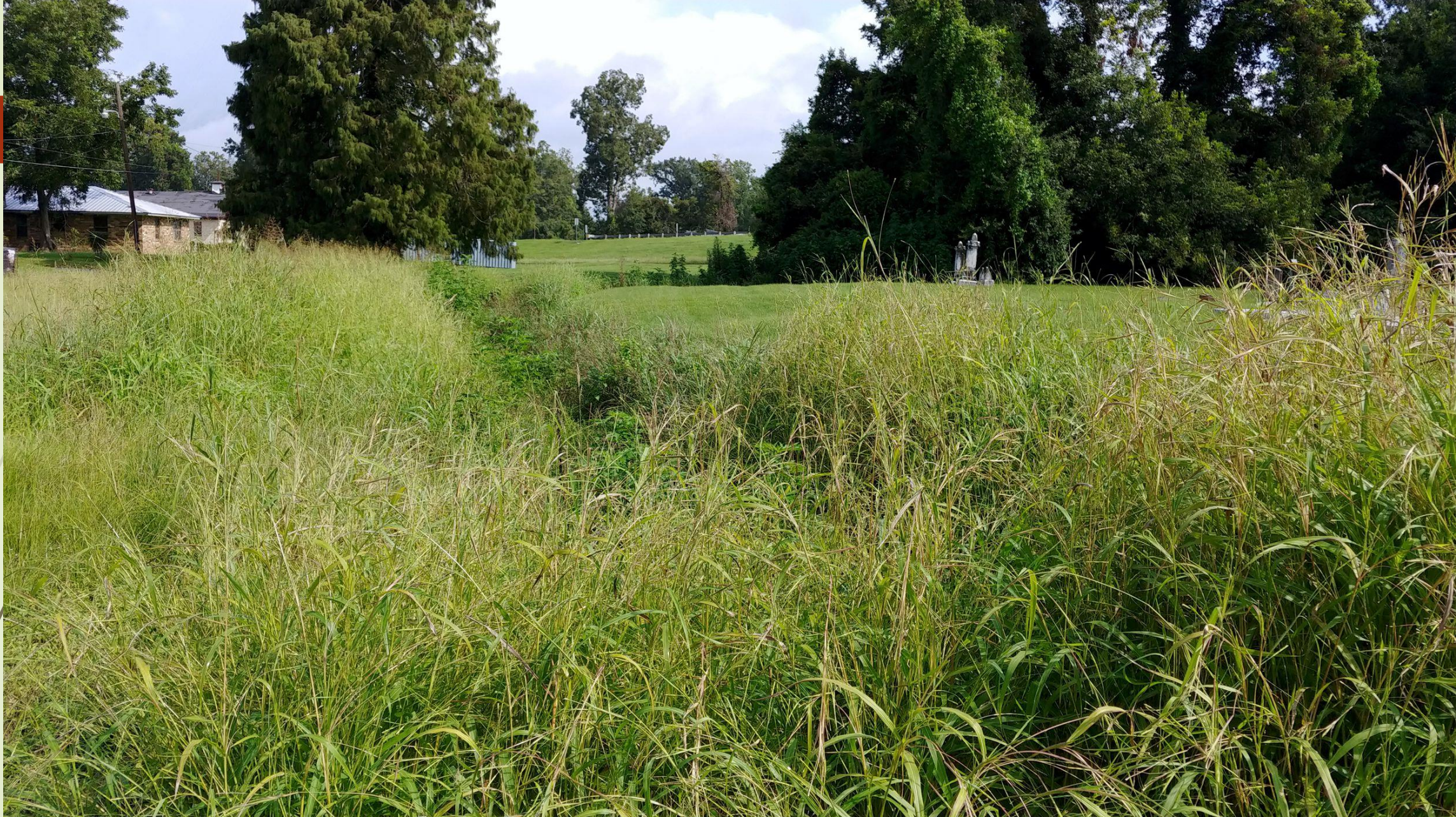
Drainage ditch adjacent to Jefferson Loop and the Masonic graveyard.