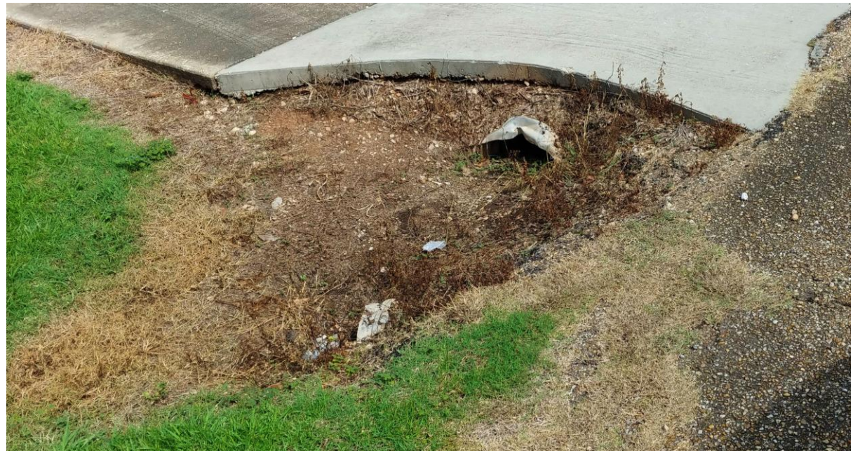
Blocked culverts in Charles Spears subdivision