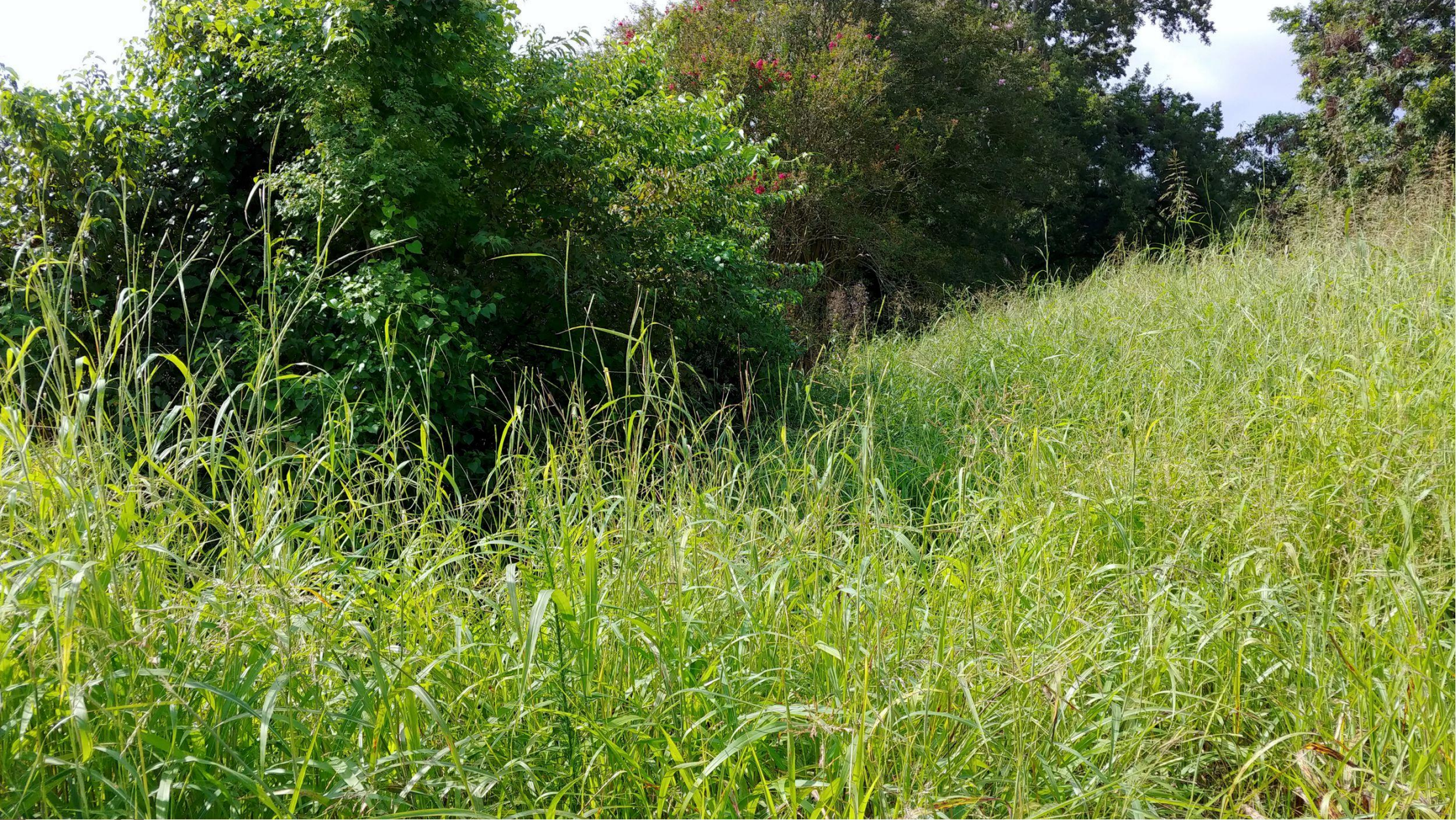
Same drainage ditch continuing across Stimley Dr. behind Green St. heading to Mayberry Pit.