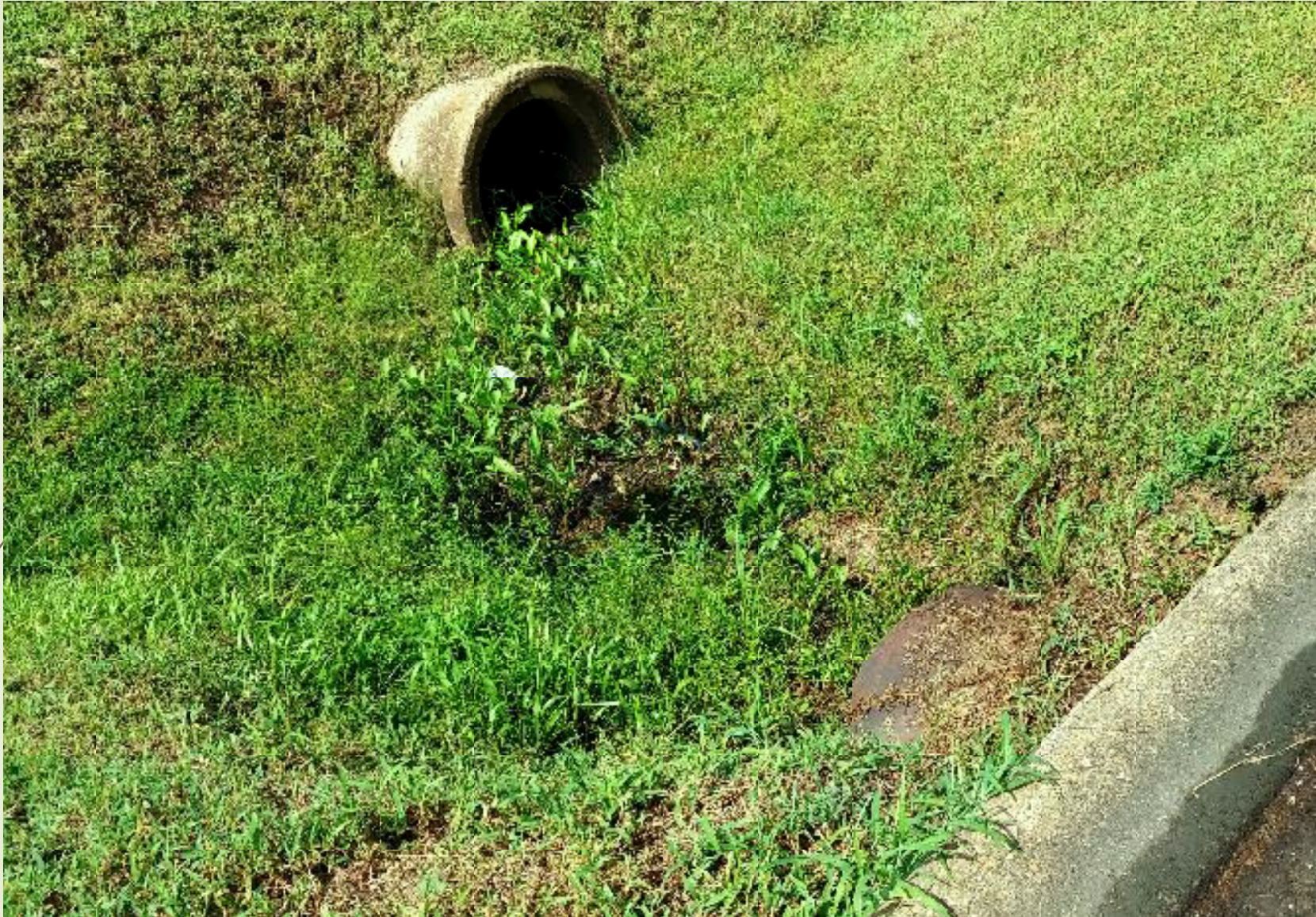
Culverts under Mission Dr. and Ehrhardt Park sidewalk