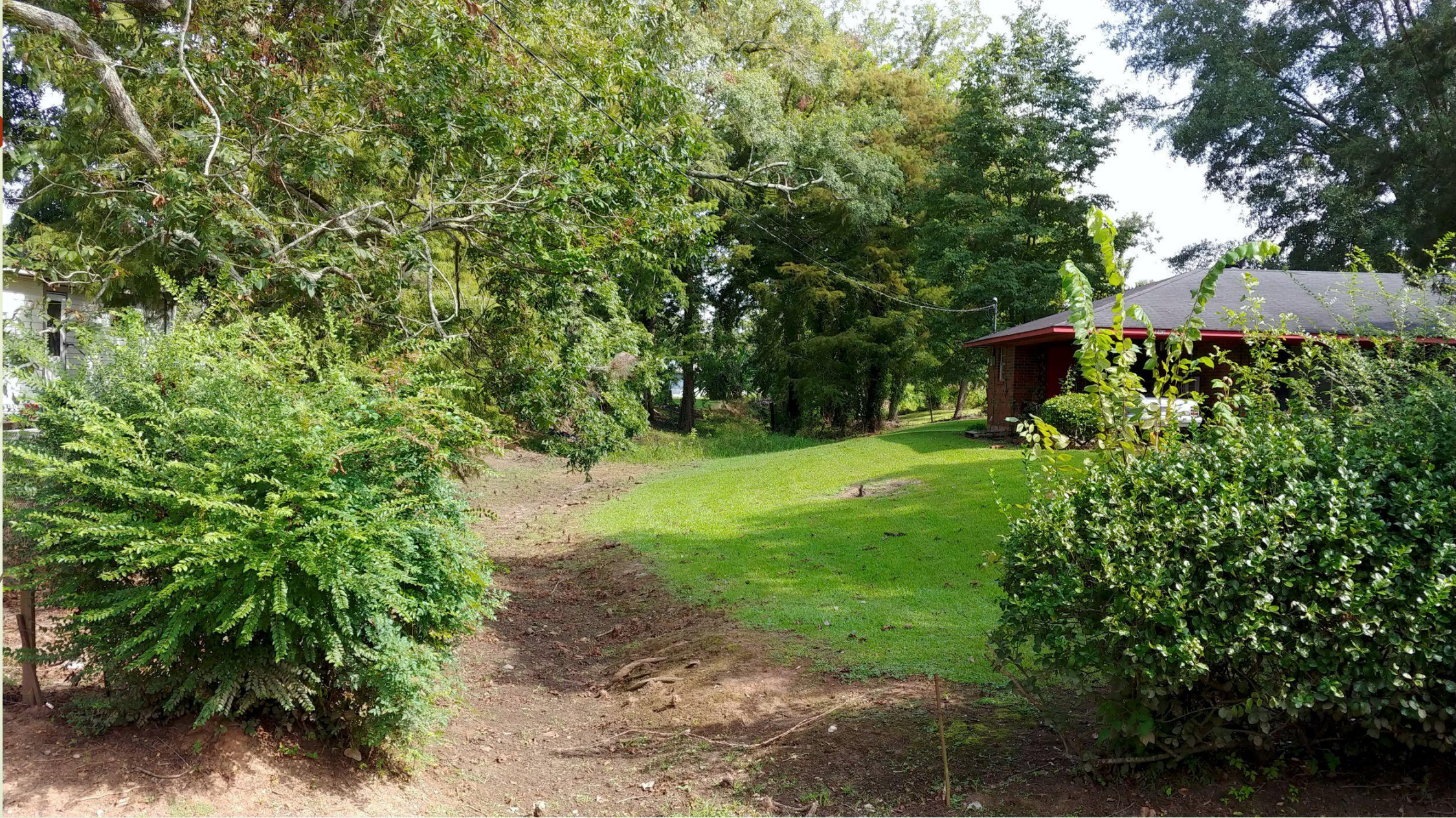
Brushy Bayou crossing Stimley Dr.