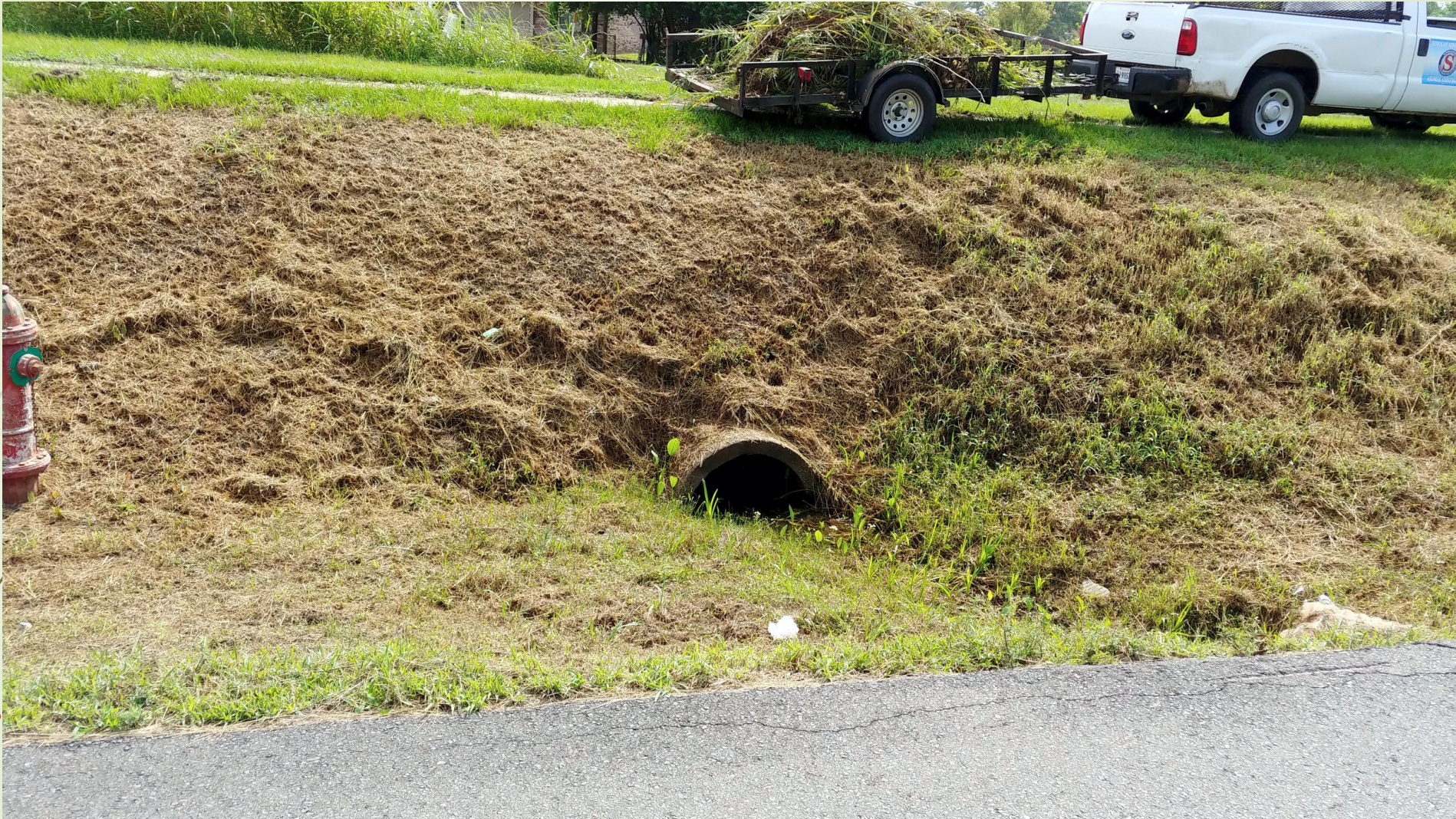
Brushy Bayou culvert on Martin Luther King Dr. near Fire Station