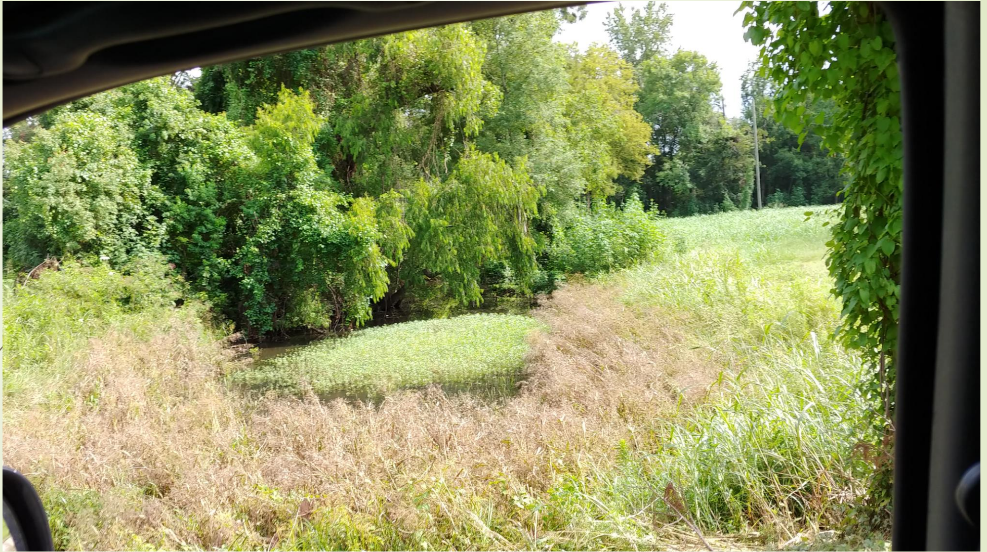
Brushy Bayou on Mission Dr. next to Town Hall