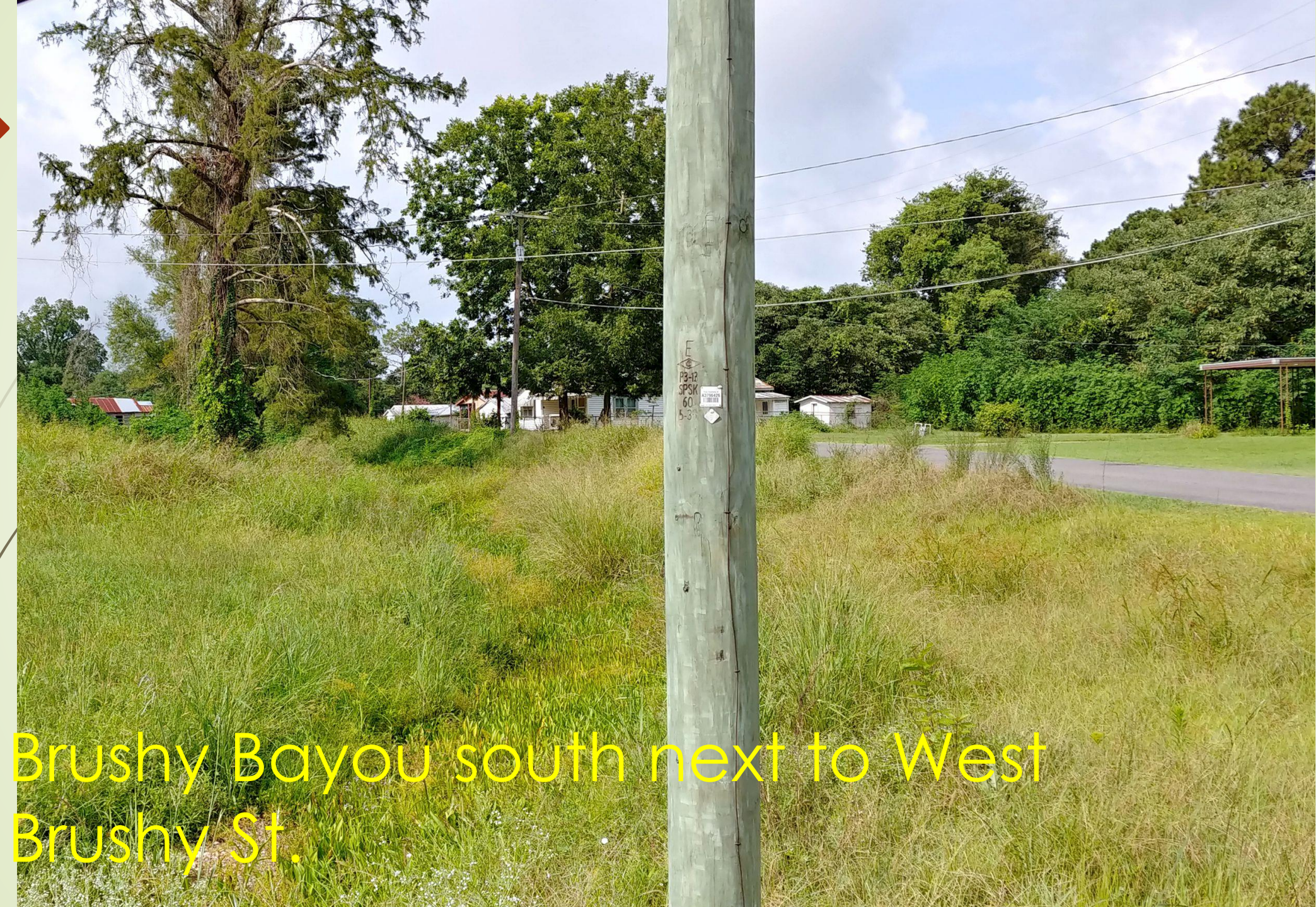
Brushy Bayou south next to West Brushy St.