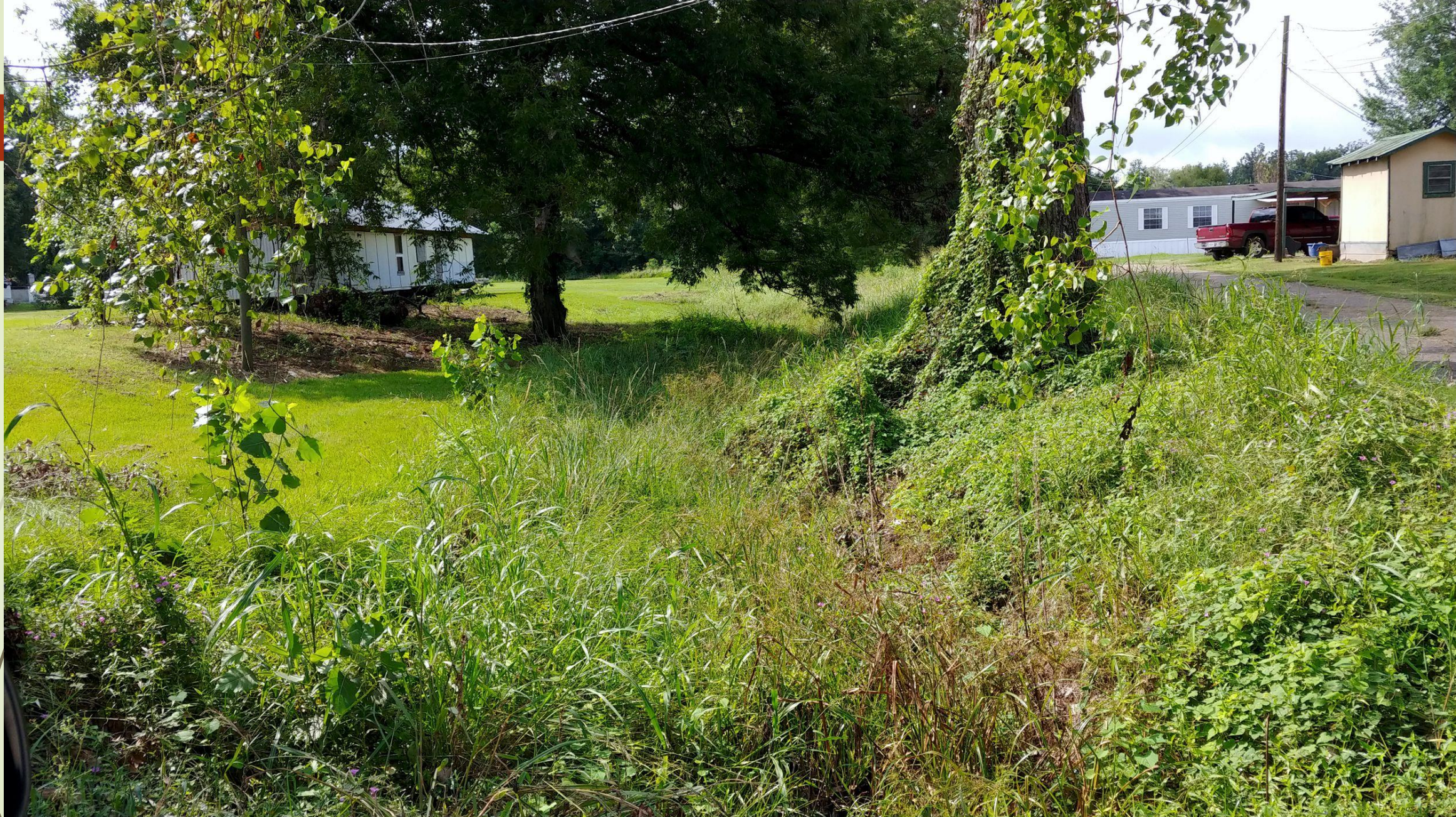
Brushy Bayou crossing Stimley going to Mayberry Pit.