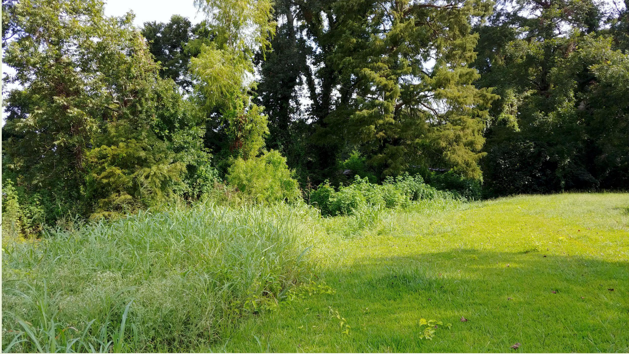
Wilson Bayou north of Riverside Dr.