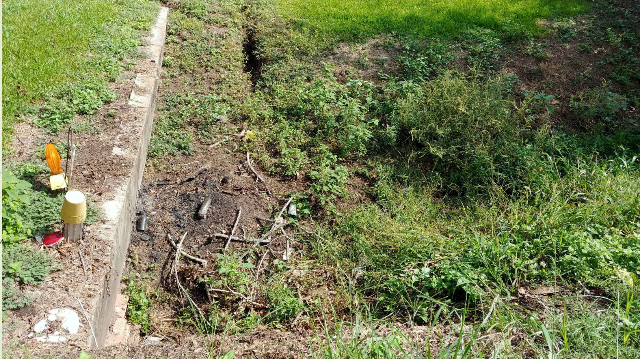
Completely blocked culvert on Riverside draining into Wilson Bayou