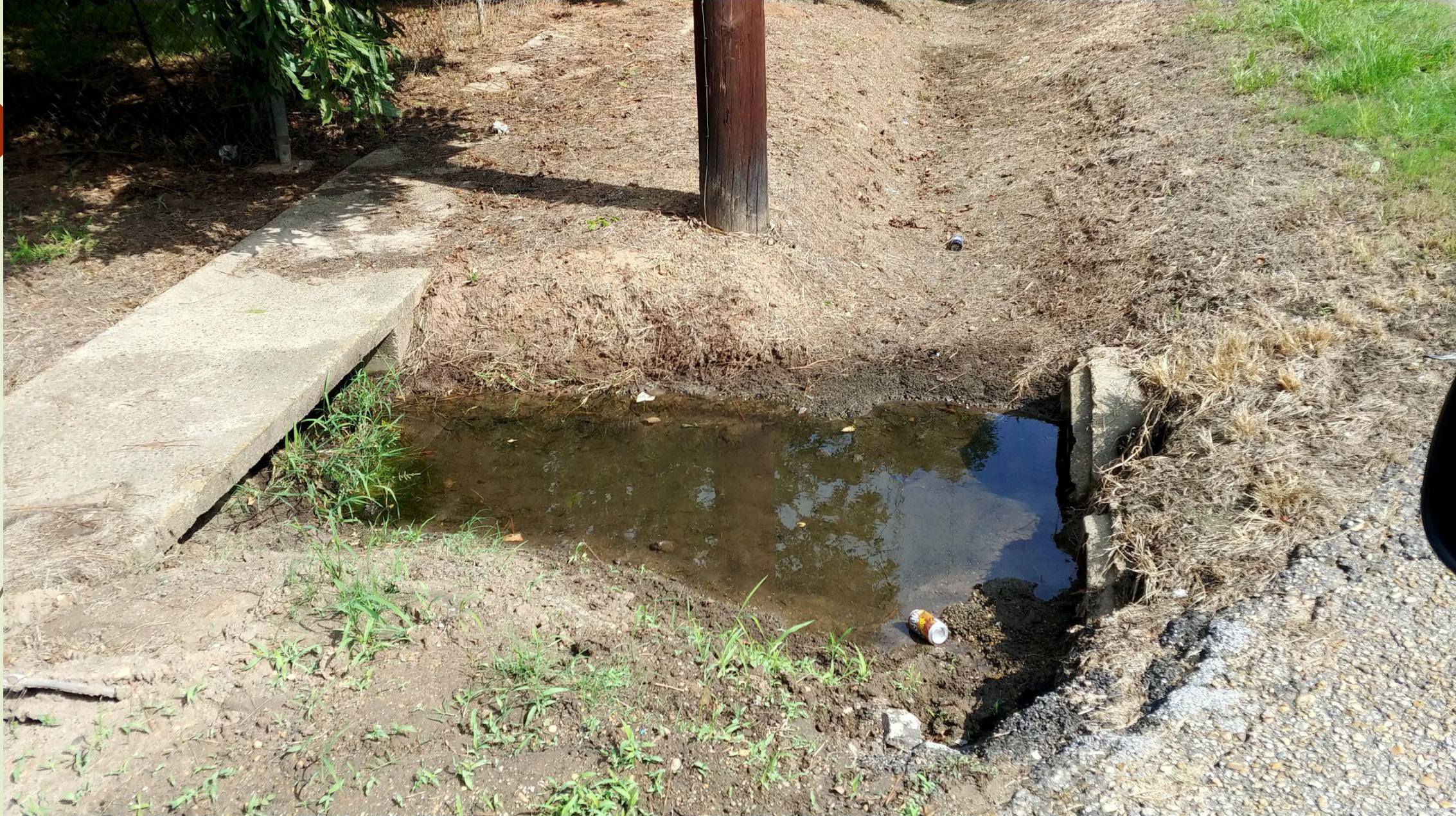
Culvert at the corner of Riverside Dr. and Norwood St.