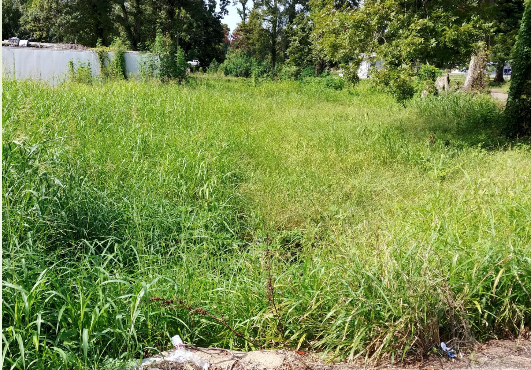
Wilson Bayou crossing Riverside Dr. adjacent to Coco's Fish Market.