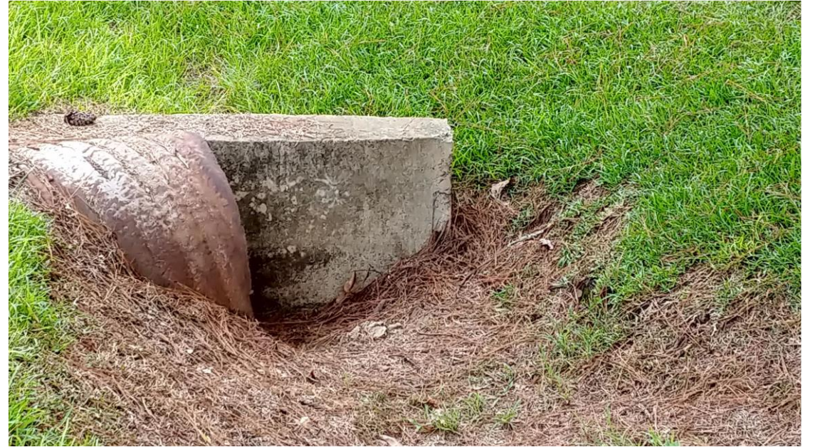
Culvert leading to drainage pit crossing Charles Dr.